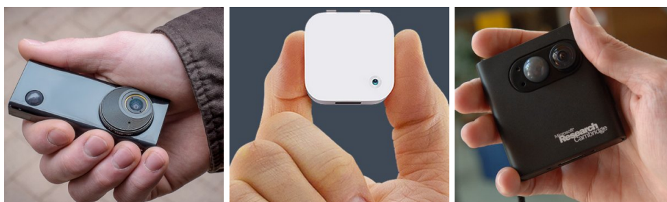
Figure 1: Three lifelogging devices: the Autographer, Narrative Clip and SenseCam.

not all of these desirable properties. The most prominent devices are probably the “Autographer” and the “Narrative Clip” [32] (left and centre images of figure 1). The Autographer was developed based on technology licensed from the SenseCam project and represents a logical continuation of it. It is smaller and lighter, features a 5 megapixel camera with a 136-degree wide-angle lens and can take up to 2,000 photos a day which are stored in its 8GB internal memory. It also has sensors to detect changing light levels, temperature, motion and orientation, as well as a GPS receiver ensuring that photos are geo-tagged. The Narrative Clip instead was developed independently with a slightly different focus in mind. In contrast to the distorted images coming from a fisheye lens, its moderate wide-angle lens (70-degree) provides “normal” pictures that are comparable to a mobile phone camera. While this means that it is unable to capture quite as much of the wearer’s surroundings, its pictures are much more “shareable” with others. It is also significantly smaller than the Autographer, making it not only easier to wear but also much more unobtrusive. However, as a result of its miniaturisation, the Clip not only has fewer sensors, but also lacks direct support for GPS data: to save battery, the Clip records raw signal strength data, which needs to be uploaded to company servers in order to be converted into actual coordinates.